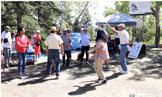
Members are in entertainment program

NSC organizes a community gathering program with community people outings every year in summertime. During this time, Newah people share, chat, and plan for upcoming activities, have potluck meals together and entertain, and get refreshments with members. This year, NSC organized a picnic in North Glenmore Park, SW, on August 11, 2023, and 92 persons attended.