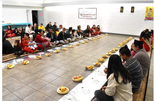
Mha Puja Celebration

NSC conducted the Mha Puja and Nepal Sambat 1144 celebration in collaboration with Calgary Nepalese Community Association (CNCA) and Nepalese Community Society of Calgary (NCSC) on November 14, 2023, at Crossroads Community Association. One of the Newah community's largest celebrations occurs during "Yampanchak-Tihar," the second-biggest celebration observed in