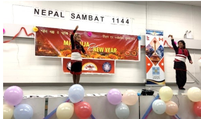
Kids performing Newah dance