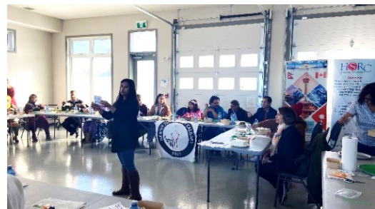
NSC was in workshop