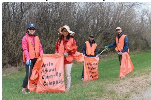
Volunteers are engaging Highway Clean Up