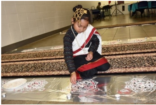
Kid decorating Mandap for Mha Puja

Mha Puja is an annual ritual performed by the Newah people as part of New Year celebrations to purify and empower the soul. It is performed on New Year's Day of Nepal Sambat (an indigenous calendar of Nepal), the national lunar calendar of Nepal, which occurs during the Swanti festival.