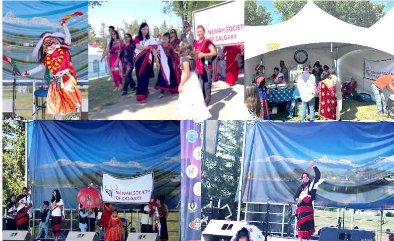
Newah activities are in Nepali Mela-2023

Newah Society of Calgary participated in the First Nepali Mela-2023 held in Prairiewinds Park, NE, Calgary, on Saturday, July 24, 2023. It was organized by Nepalese community-based Organizations with the slogan “Our Culture, Our Identity and Our Pride: Let’s Embrace together.” NSC excitedly participated in showcasing and promoting Newah culture and heritage in this program with a parade, Jhaki, multicultural showcase, Newah cuisine and Newah cultural dance performed. Around 700 Newah people visited this event across Alberta. During the events, Newah cultural activities were highly appreciated and encouraged to get them in 2024 Nepali Mela, too. NSC also achieved a great opportunity to explore its cultural values and vibes and strengthen in this event.