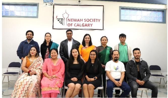
Executive Boards members